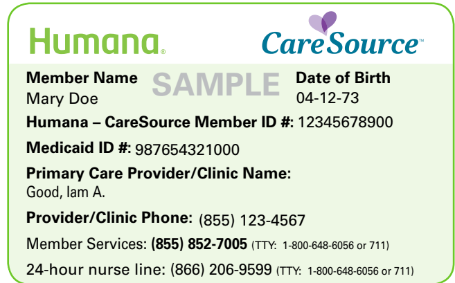
Managed Medicaid Product Medicaid ID Card (no copay collected)